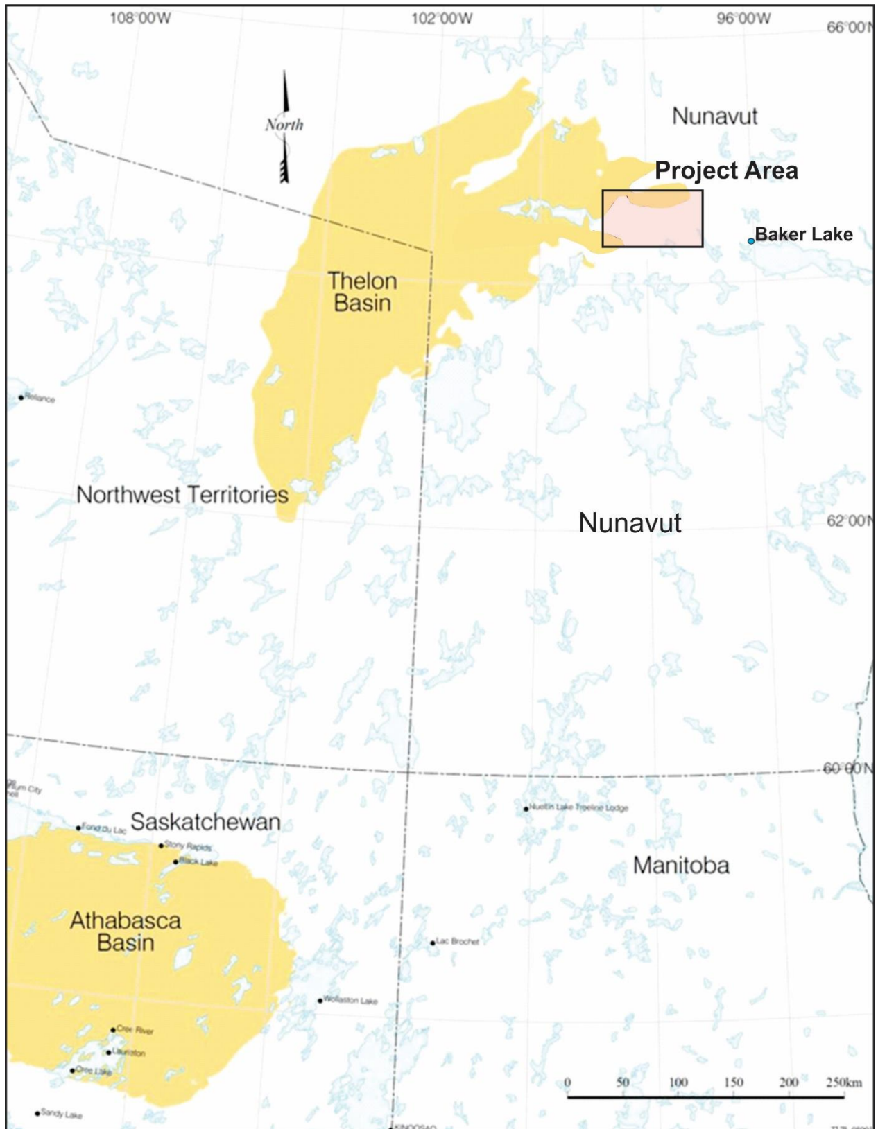
Figure 2: Location of the Athabasca Basin, Saskatchewan and the Thelon Basin, Nunavut. These two geological areas of the Canadian Shield host the world's richest uranium deposits.