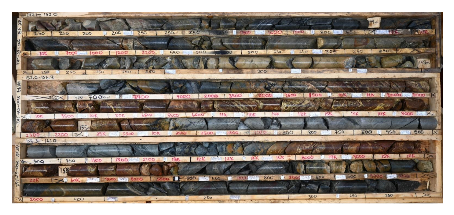
Figure 3 TAT23-002 drill core from the mineralized section (147.1 to 161.0 m). Scintillometer readings are written on the core boxes in counts per second and were measured using a digital, hand-held CT-007M scintillometer by Environmental Instruments Canada Inc.