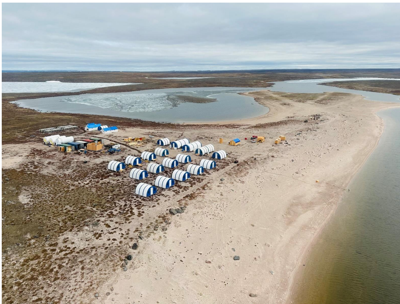
Figure 4 Forum’s newly-constructed 30-person drill camp located on Aberdeen Lake at the western end of the property.